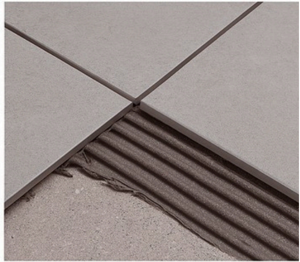
4. Adjustment Time