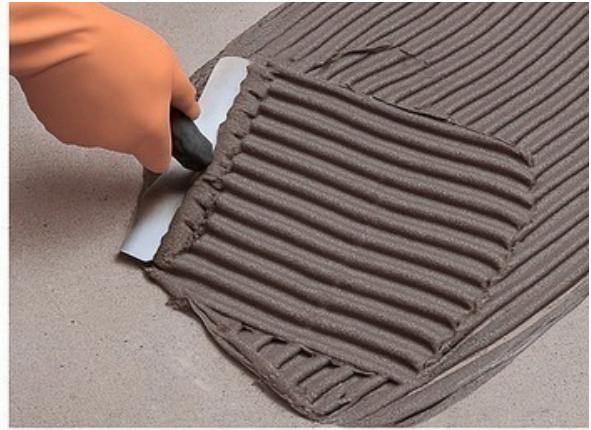
2. Adhesive Application