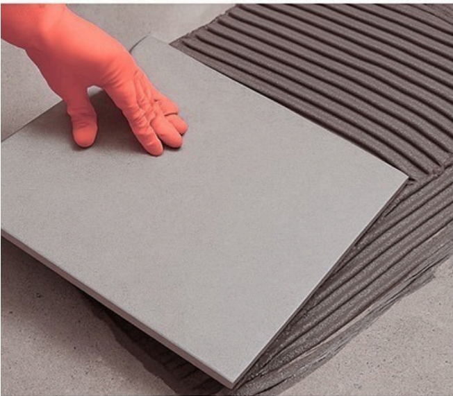
3. Tile Fixing