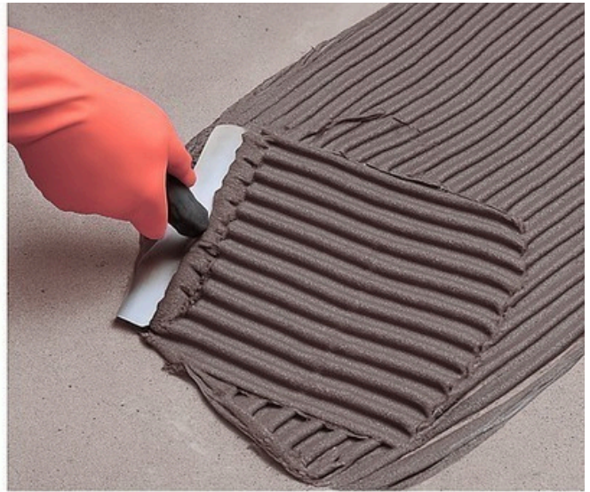
2. Adhesive Application