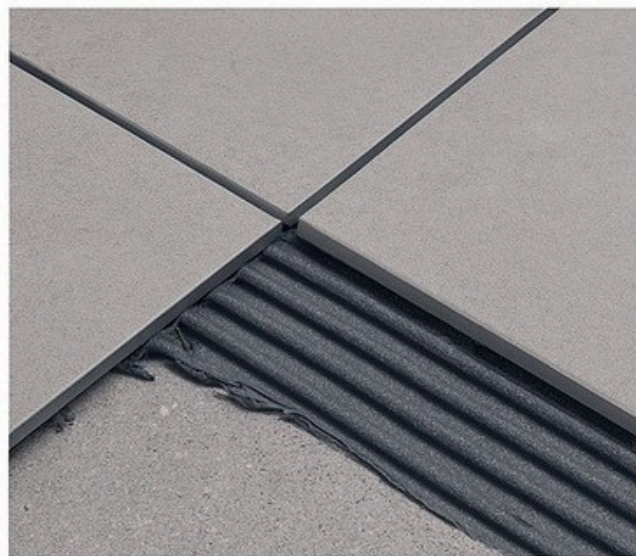
4. Adjustment Time