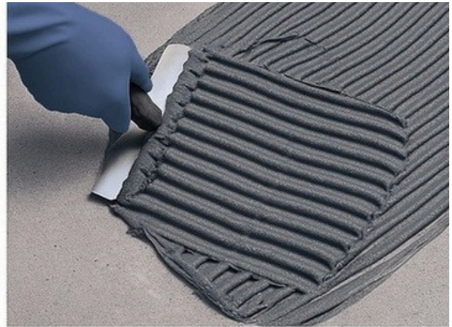
2. Adhesive Application