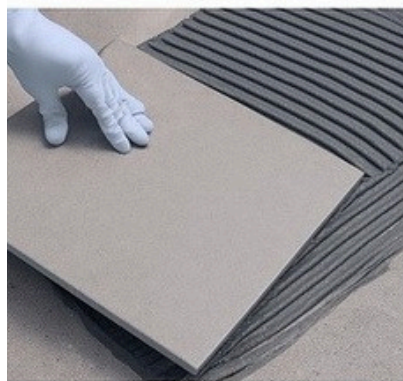
3. Tile Fixing