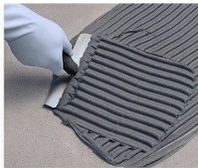
2. Adhesive Application